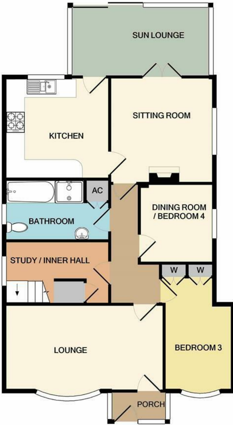
GROUND FLOOR APPROX. FLOOR AREA 942 SQ.FT. (87.5 SQ.M.)